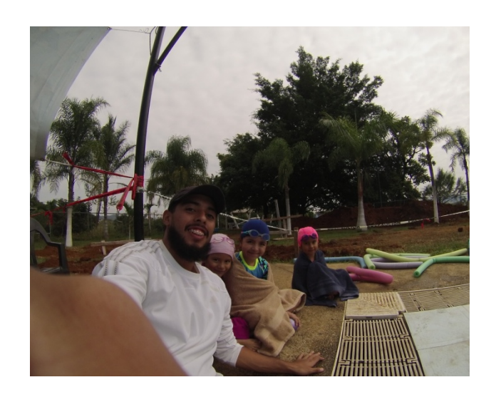
I have an older sister and young brother. We are a good friends.